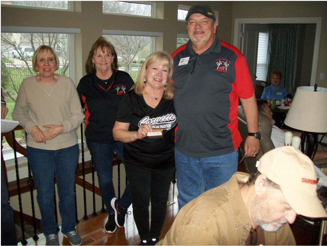
Winners of Crazy Bowl women's and men's lowest bowling score.