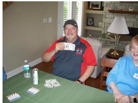
Winners of Left Right Center