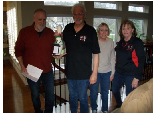
Winners of Crazy Bowl women's and men's highest bowling score.