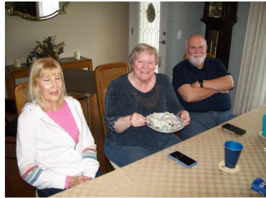
Winners of Left Right Center