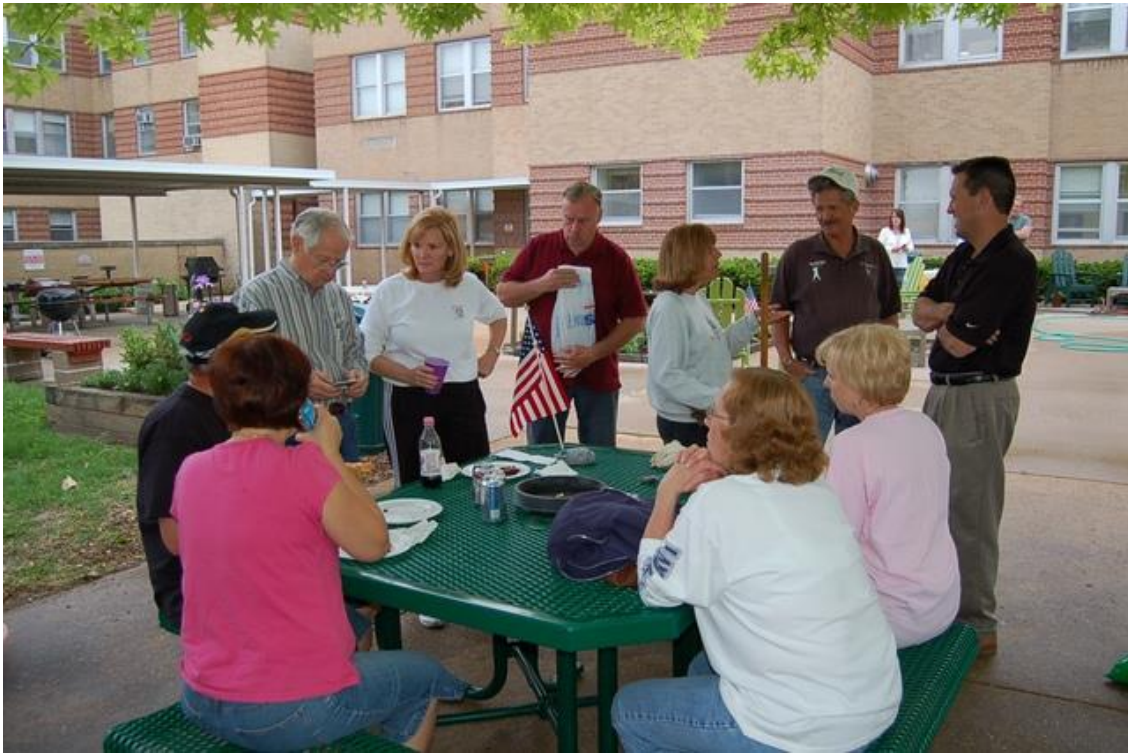
All the workers finally relaxing after the VA garden cleanup in April 2010.